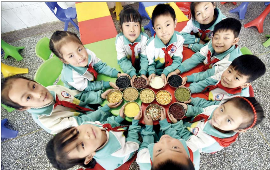
Knowing nature: Pupils at a school in Liaocheng, in East China's Shandong province, learn to distinguish different grains on Oct 29, World Thrift Day.