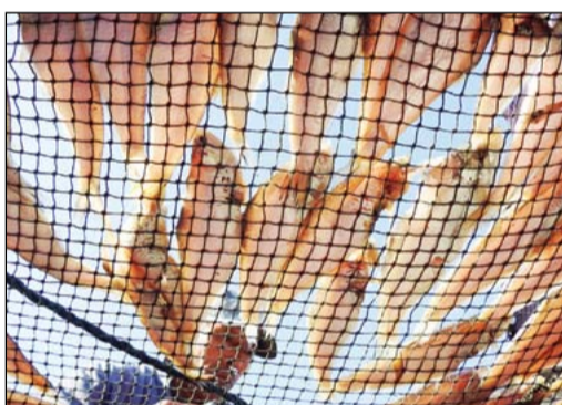
Sea bounty: Harvest time begins in Lianyungang, East China's Jiangsu province, where various kinds of fish are dried.