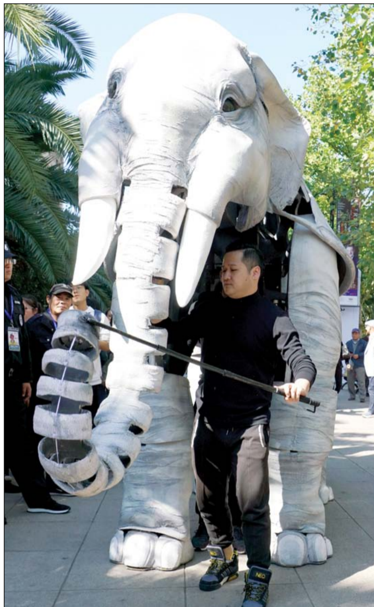
Pachyderm puppet: A giant puppet elephant goes on parade at an event during the China Shanghai International Arts Festival in Shanghai on Oct 28.