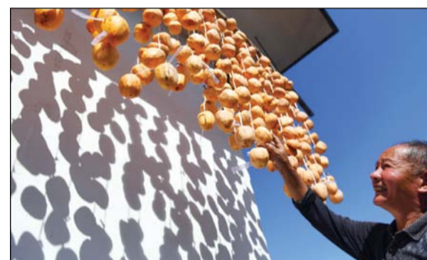
Preparing for winter: Persimmons are hung up to dry in a village in Huangshan, East China's Anhui province, on Oct 29. Drying makes them easier to store for long periods.