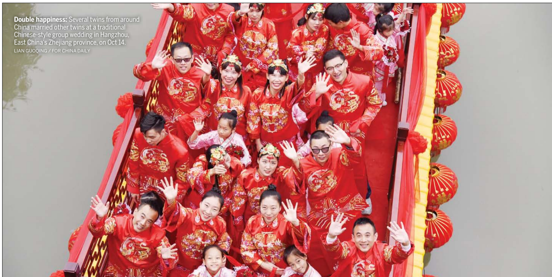
Double happiness: Several twins from around China married other twins at a traditional Chinese-style group wedding in Hangzhou, East China's Zhejiang province, on Oct 14.