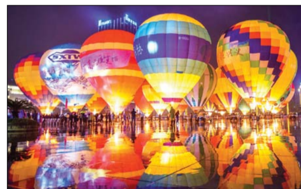
Upward bound: Colorful hot-air balloons brighten Jushan square in Xingyi, in Southwest China's Guizhou province, on Oct 14.