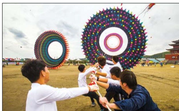
No strings attached: People work together to fly a giant kite at an international kite tournament in Zhoushan, Zhejiang province, which attracted more than 66 teams from home and abroad from Oct 13 to 14.