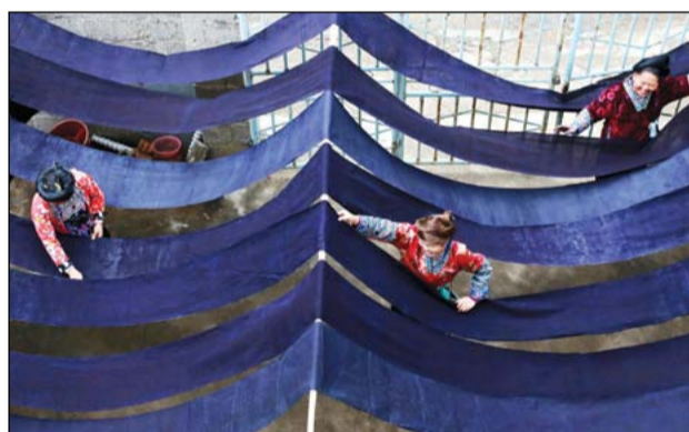
Cotton fabric: Villagers in Hongshui township, Rongshui Miao autonomous county, in South China's Guangxi Zhuang autonomous region, dry dyed cotton fabric in a courtyard. The town is famous for traditional fabrics.