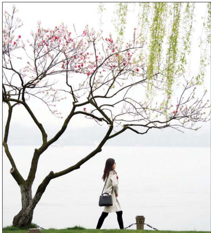
Lake stroll: A visitor walks along the Bai Causeway at the West Lake scenic spot in Hangzhou, East China's Zhejiang province, on March 26.