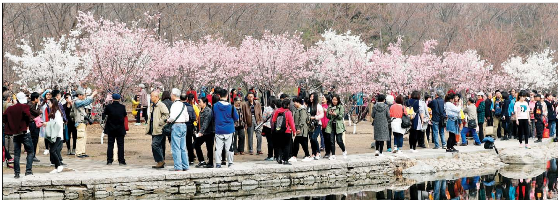
In bloom: Visitors enjoy the flowers in Yuyuantan Park, Beijing, on March 27 during the monthlong cherry blossom cultural festival, which opened that day.