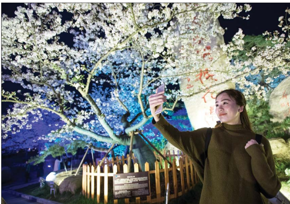
Night flowers: A tourist takes a picture of cherry blossom, illuminated at night, in Donghu Park in Wuhan, Central China's Hubei province, on March 26.