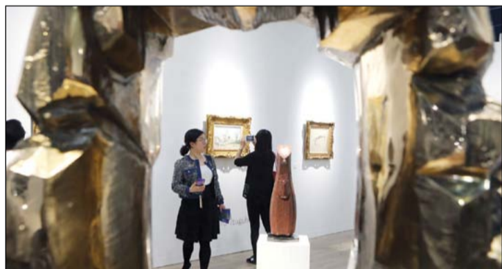
Art show: Visitors view an exhibit during a preview on March 27 of an event staged by Art Basel in Hong Kong. The three-day event, which opened on March 29, featured works from a total of 248 art galleries from 32 countries and regions.