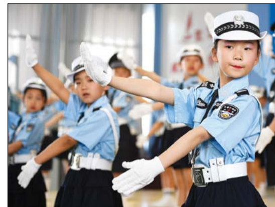
Safety signs: Students learn police signals for directing traffic as a school promotes road safety awareness for young people in Yinchuan, in Northwest China's Ningxia Hui autonomous region.