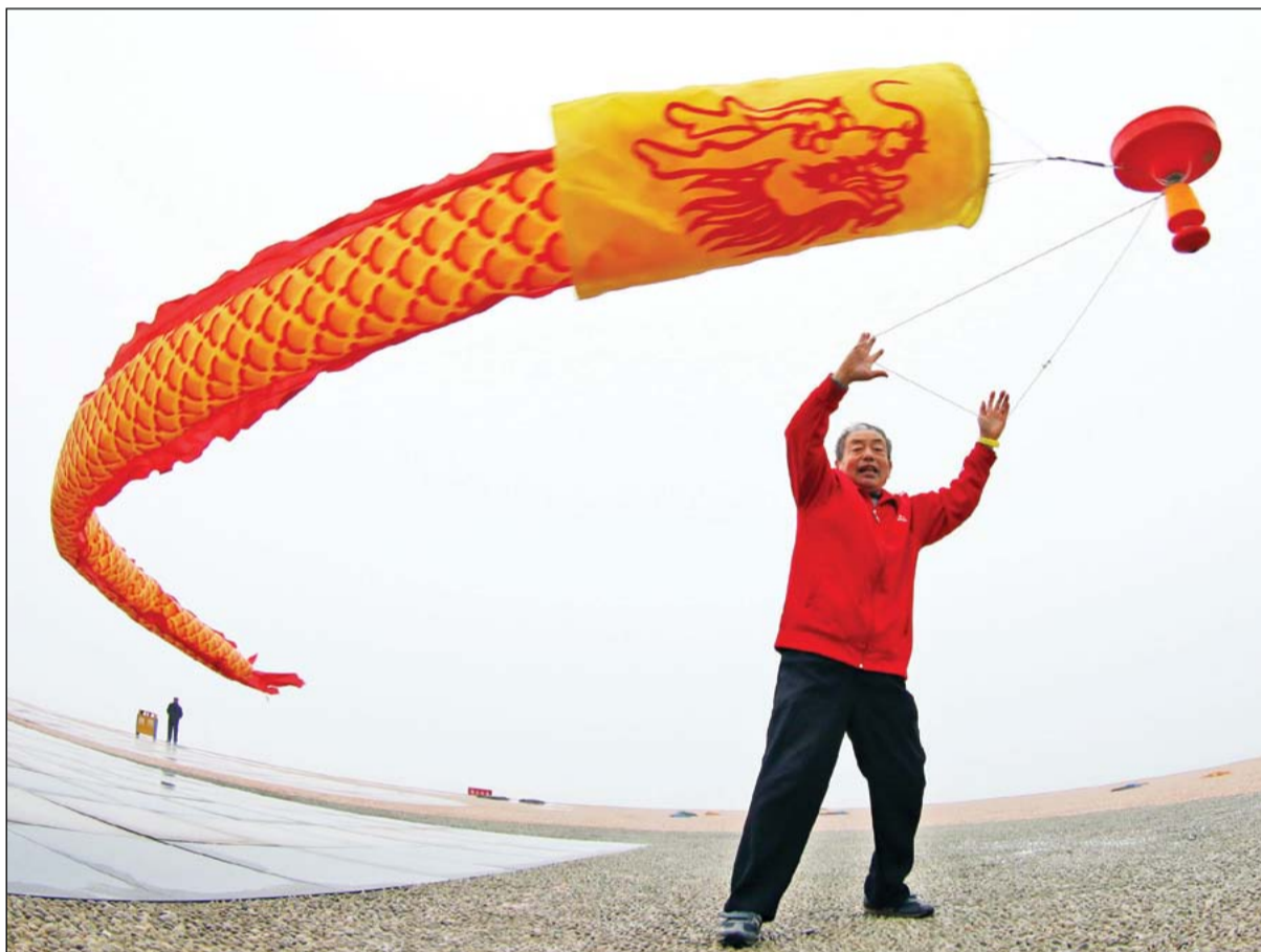
Dragon play: A man uses a diabolo, or Chinese yo-yo, attached to a dragon kite to celebrate the traditional Chinese Longtaitou Festival, or Dragon Head-Raising Festival, on March 18 in Yantai, East China's Shandong province.