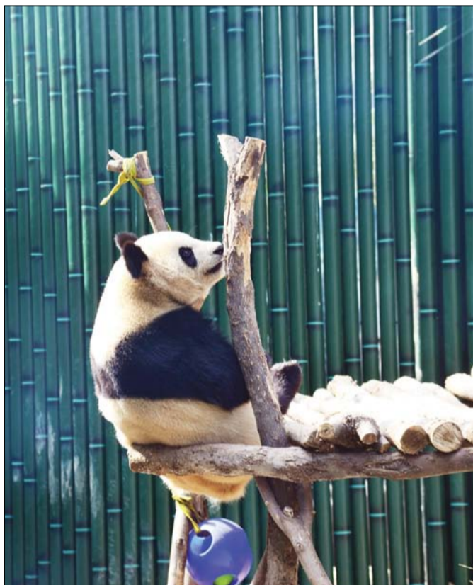
Panda fun: A panda plays outdoors at Beijing Zoo on March 19 as warming temperatures were forecast for the capital.