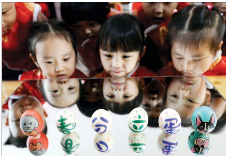
Spring tradition (left): Children look at eggs in Handan, in North China's Hebei province, on March 21 to mark Spring Equinox, or Chunfen in Chinese. The Chinese tradition of balancing eggs on the day of the vernal equinox is said to be 4,000 years old.