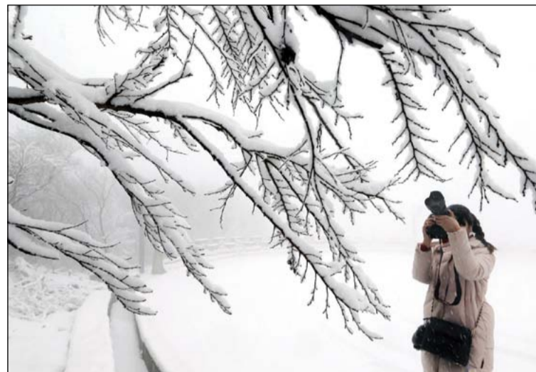
White mountain: Yuntai Mountain is enveloped in white after snowfall at the scenic spot in Lianyungang, in the eastern Jiangsu province, on March 20.