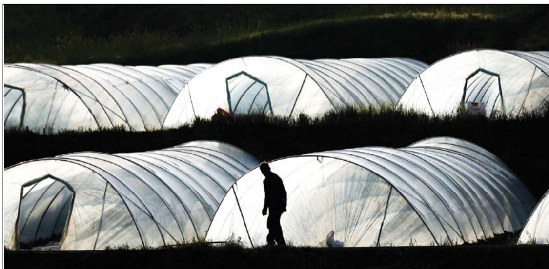
Field work: A farmer tends to watermelons in Xingren township of Danzhai county, Southwest China's Guizhou province, on March 20.