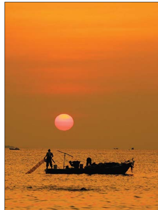
Sunset sail: A fishing boat is silhouetted against the sunset in Sanya, South China's Hainan province, on March 6.