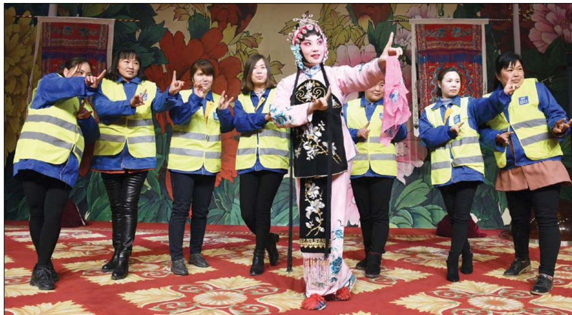
Change of roles: More than 100 female workers from China Construction Third Engineering Bureau saw a Peking Opera performance at Meilanfang Grand Theater in Beijing on March 6 to celebrate Women's Day.