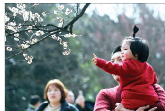
In bloom: Visitors enjoy the plum blossom at Meihua Mountain in Nanjing, in East China's Jiangsu province, on March 4.