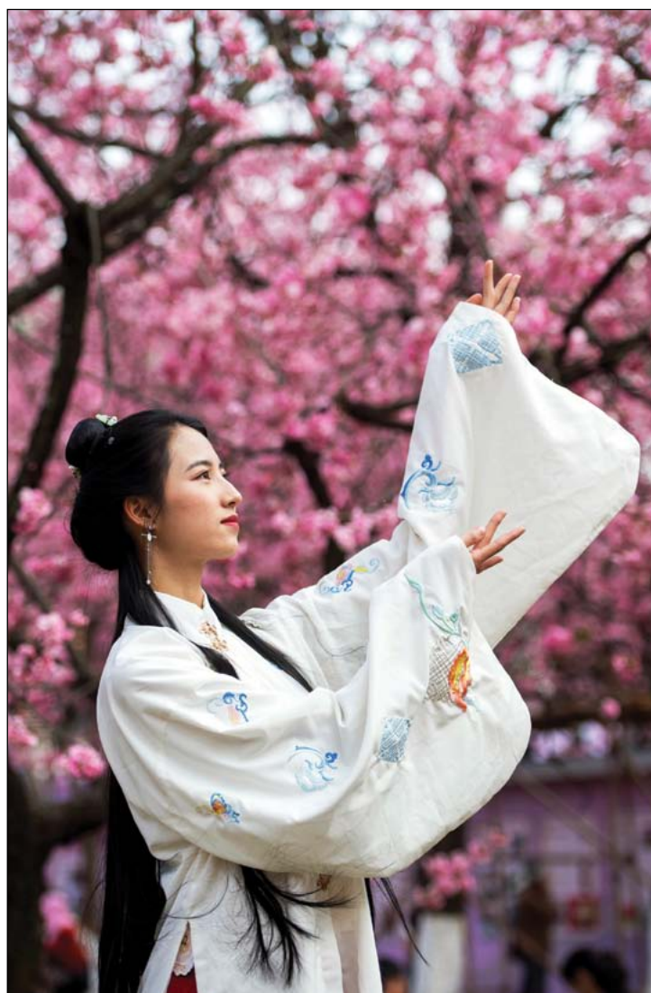
Pretty in pink: A girl dressed in a costume inspired by the Han Dynasty strikes a pose amid cherry blossoms at Yuantongshan Garden in Kunming, in Southwest China's Yunnan province, on March 6.