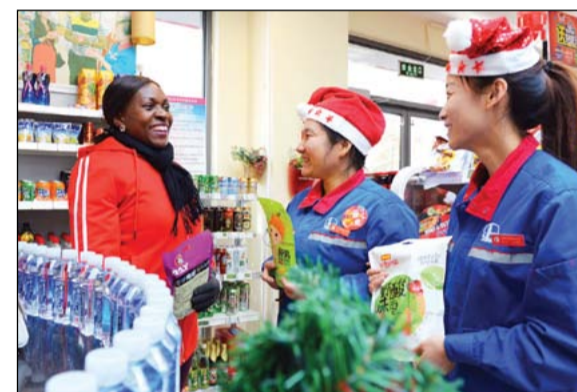
Yule fuel: In the run-up to Christmas on Dec 15, gas station assistants in Beijing, dressed in Santa Claus hats, serve a Kenyan customer.