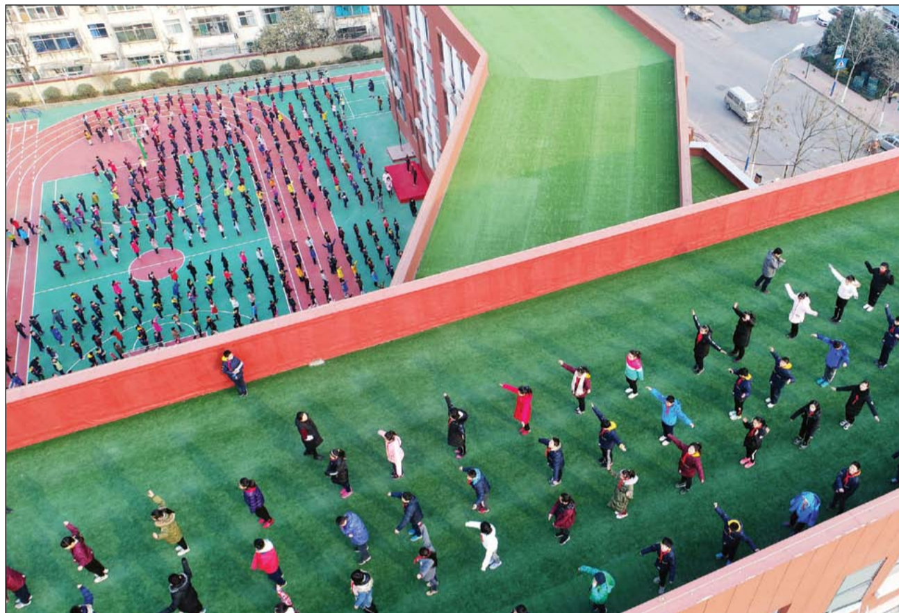
Top form: Pupils exercise between classes at a primary school in Jinan, the capital of East China's Shandong province, on Dec 13. Due to limited space, the school transformed a rooftop into a training ground.