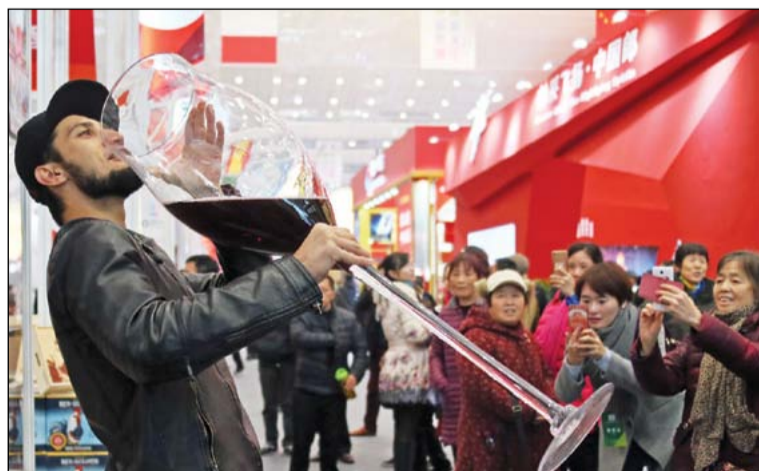
One for the road: A wine and spirits festival that began on Dec 18 in Yibin, Southwest China's Sichuan province, attracted drinks producers and distributors from 17 countries.