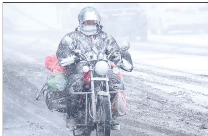
Freezy rider: A man on a motorbike braves the cold in Dalian, in the northeastern Liaoning province, on Dec 16, during the city's first snowfall this winter.