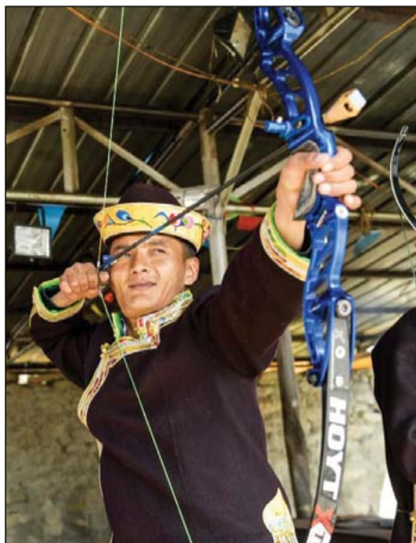
Taking aim: A villager performs archery to celebrate the New Year at Lunang township in Nyingchi, Southwest China's Tibet autonomous region, on Nov 19. Nov 11 is the first day of the Kongpo New Year in the Nyingchi area, according to the Tibetan calendar.