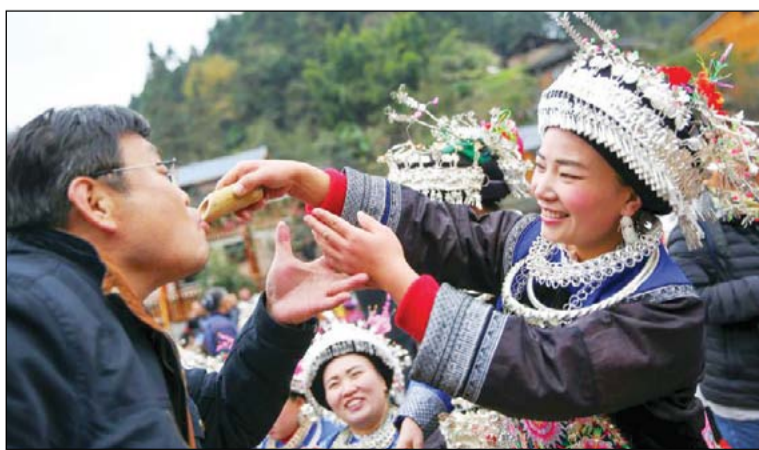
Celebration: Miao people celebrate the traditional New Year festival in Jianhe county of the Qiandongnan Miao and Dong autonomous prefecture in Southwest China's Guizhou province on Nov 20.