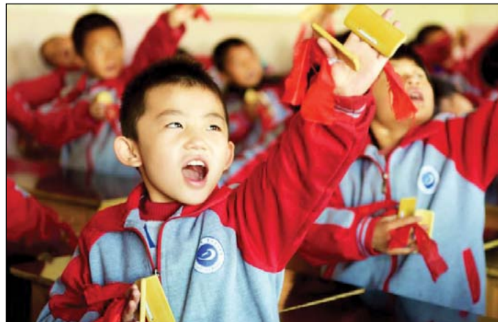
Culture lesson: Children from a school in Hengshui, North China's Hebei province, recite the Three Character Classic , a Confucianist volume to educate young children, with bamboo clappers, a traditional Chinese percussion instrument.