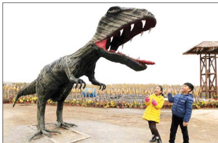
Treading with dinosaurs: A dinosaur installation, made by villagers from more than 10,000 waste tires, is on display in Zaozhuang, in the eastern Shandong province.