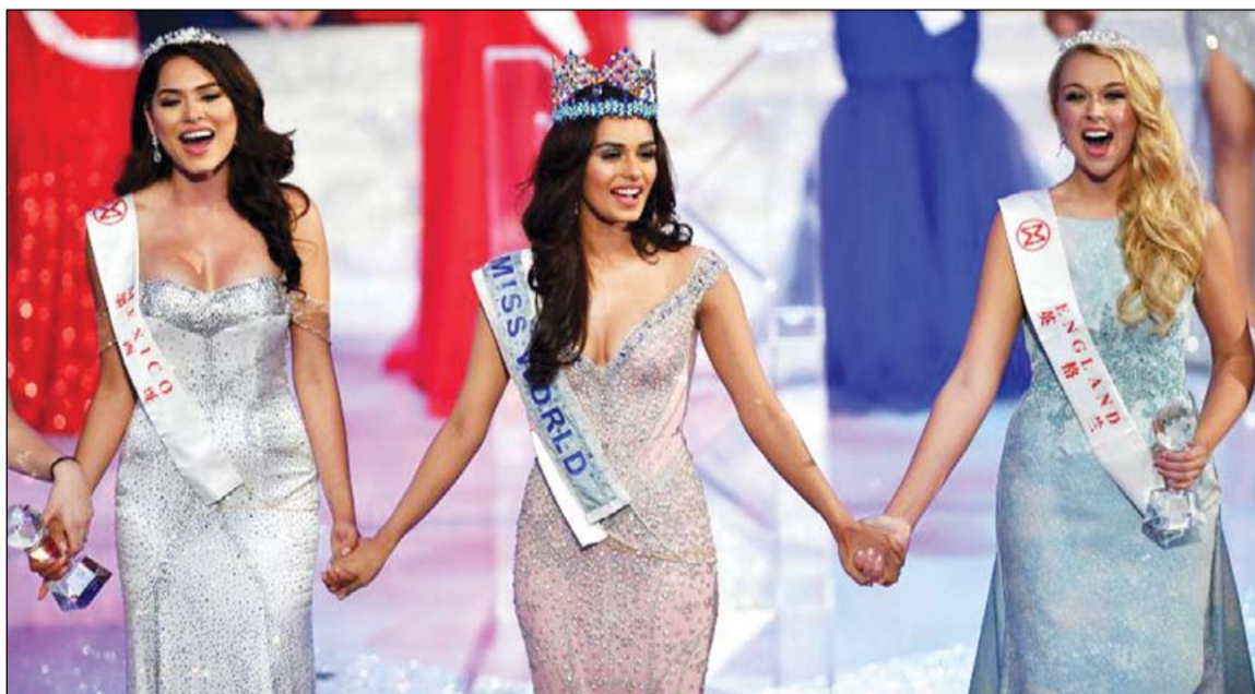
Beauty title: India's Manushi Chhillar (center) is crowned at the 67th Miss World Competition in Sanya, in the southern Hainan province, on Nov 18.