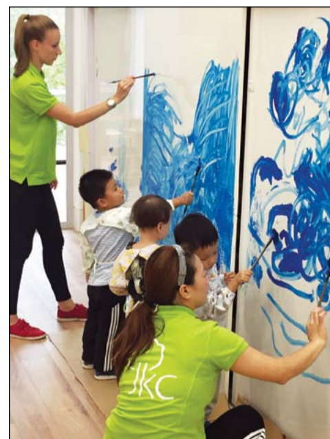
Children paint with their carers at a kindergarten in Beijing, on Sept 26. MILAN (SERBIA) / FOR CHINA DAILY