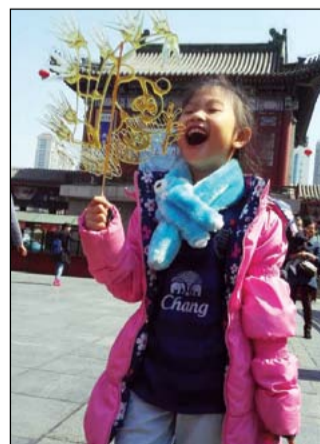
A girl displays a piece of sugar art she bought at Ancient Culture Street in the northern city of Tianjin, on March 25, 2016.