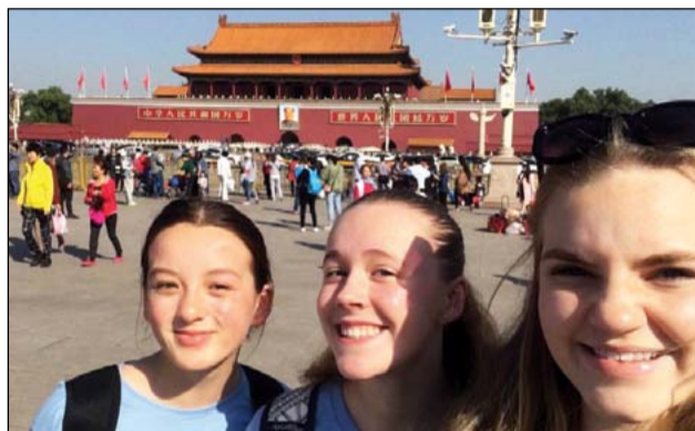
Foreign students take a selfie in front of Tian'anmen Gate in Beijing, on Sept 29.

More foreigners are traveling, working and studying in China. Many are fascinated by the country's culture and impressed by its rapid development. Using smartphones, they share online photos that they have taken in China, showing an innovative country and the prosperous lives of its people. The pictures here are from a collection called Forging Ahead (2012-2017): Amazing China — A Fresh Perspective .