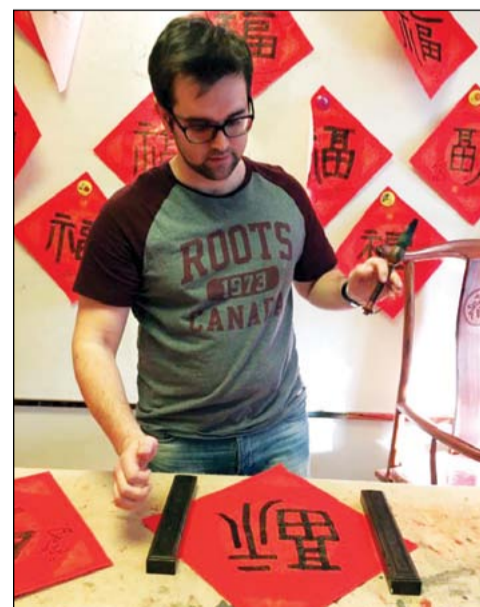
An expat writes the Chinese character for fu (happiness) during Spring Festival in Nanjing, East China's Jiangsu province, on Jan 28.