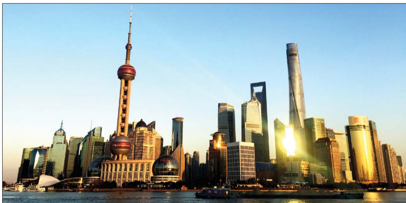
Skyscrapers in Lujiazui in Shanghai's Pudong New District are tinged by the sunset on Dec 17, 2015.