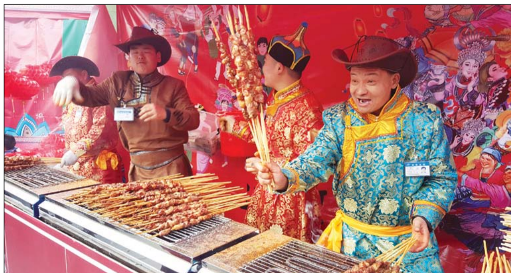
Vendors, dressed in traditional Mongolian robes, sell shish kebabs at a temple fair in Beijing, on Jan 28.