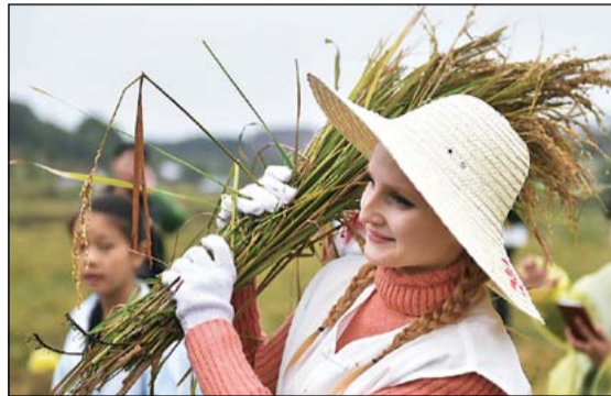
Harvest time: The rice harvest festival in Jurong, in East China's Jiangsu province, attracted more than 2,000 tourists, including overseas students from surrounding cities.