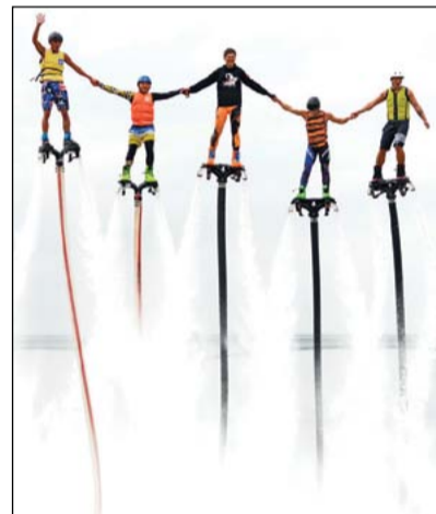
Water test: Contestants enjoy one of the activities at the International Motorboat Open, held from Oct 14 to 16 on the Cao'e River in Shaoxing, East China's Zhejiang province. People from 15 countries took part in the event.