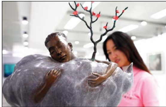
Art show: The seven-day National University Arts Festival began at Moji, in East China's Shandong province, on Oct 14, presenting 400 pieces of art created by university students.