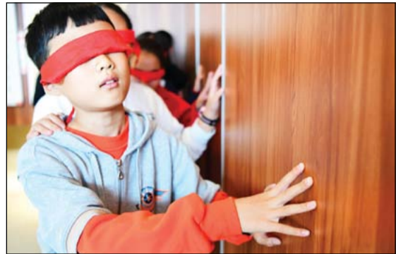
Hard lesson: Students cover their eyes in an effort to experience the hardship faced by blind people, at an event at a library for the visually challenged in Langfang, Hebei province, on Oct 15.