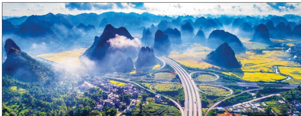
The scenery along the Hepu-Napo Expressway in the Guangxi Zhuang autonomous region in South China is out of this world.