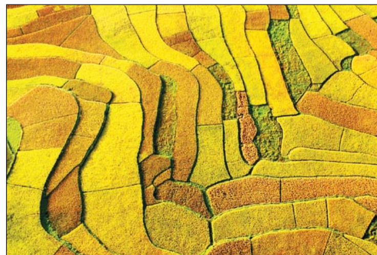
Rice paddy fields in Huaxi district, Guiyang, Southwest China's Guizhou province.