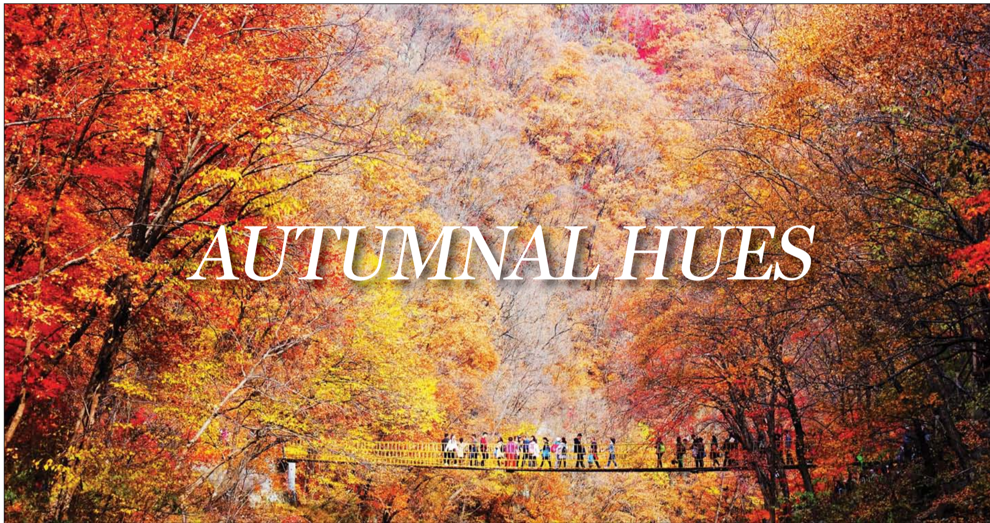
Hundreds of spectators turn out for the fall foliage season in Kuangzigou Scenic Zone in Northeast China's Liaoning province.

Each October, landscapes across China become tinged with vibrant autumnal colors as russet and ochre hues sweep the country's scenery. Warm sunshine bathes the central provinces and turns leaves a brilliant red, as early snows lay their first blanket to the north. Everywhere you travel, you can join visitors from around the world in catching a breathtaking glimpse of China's nature in transition.