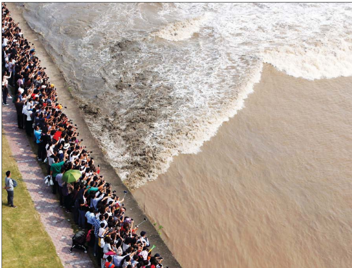
Tide show: Tourists watch the tidal bore on the Qiantang River in Hangzhou, capital of Zhejiang province, on Oct 7, which is the 18th day of August in the Chinese lunar calendar, the best time to view the phenomenon.