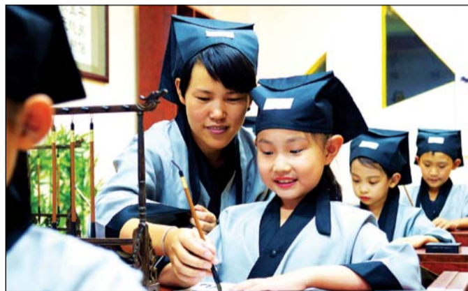
Art of writing: Students from Hanshan District Elementary School practice calligraphy at one of the school's traditional culture events on Oct 6 in Handan, Central China's Henan province.