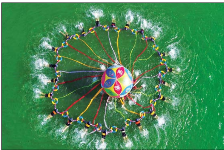
Water fun: A performance at the China Liuzhou International Water Carnival on Oct 1 in Liuzhou, in South China's Guangxi Zhuang autonomous region.