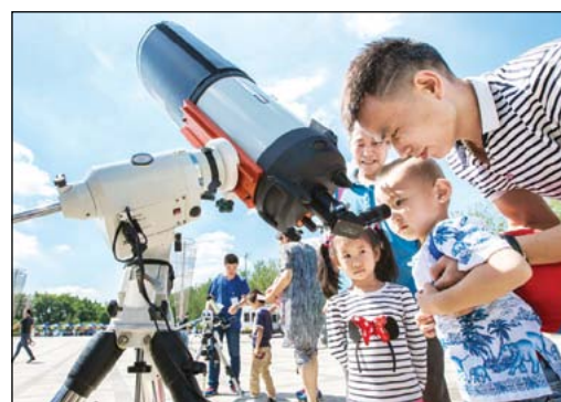
Seeing the light: Children try to observe the sun at the Nanjing Science and Technology Museum in Nanjing, East China's Jiangsu province, on Sept 16, national Science Awareness Day.