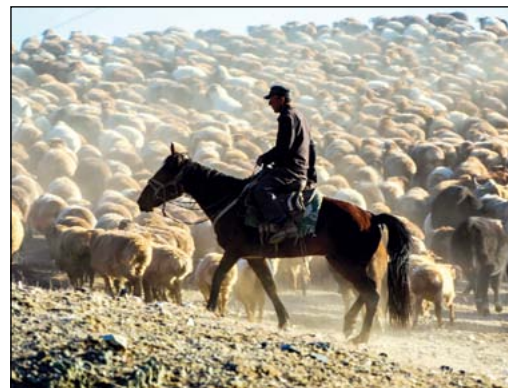
Chill ahead: Herdsmen transfer cattle to winter pastures in Fuyun county of the Xinjiang Uygur autonomous region in Northwest China.