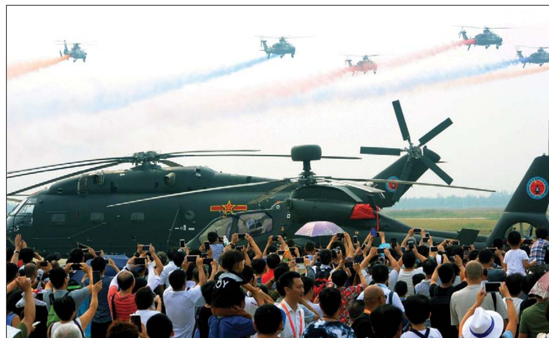
Top flight: Visitors gather to watch a helicopter at the fourth Tianjin International Helicopter Exposition on Sept 16 in the northern city of Tianjin.