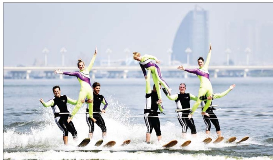
Water fun: A team from the United States was among the competitors at the fourth China Yihe International Water Ski Open in Linyi, Shandong province, on Sept 19.