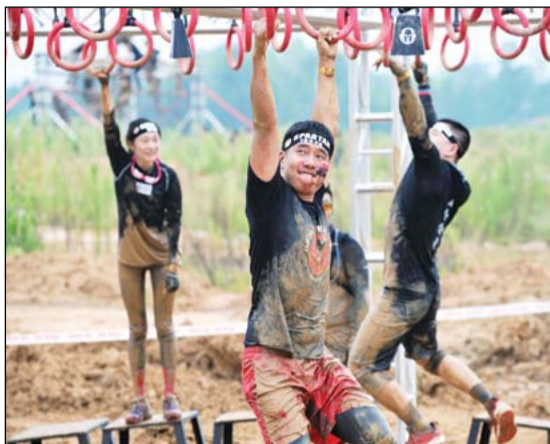
Big race: More than 4,000 people from around the world came to Qingdao, East China's Shandong province, to compete in the Spartan Race in the city's SinoGerman Ecopark on Sept 10.