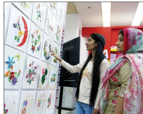
Craft show: Handicrafts by Shijia Primary School students are displayed at the 12th China International Cultural and Creative Industry Expo in Beijing on Sept 11.