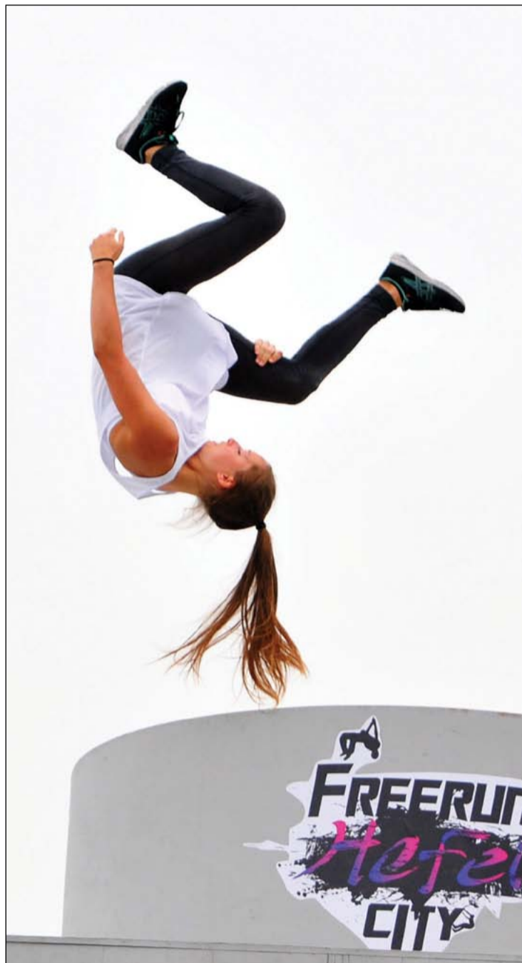
Tough test: A parkour fan takes part in a competition during the 2017 Hefei International Parkour Open in Hefei, East China's Anhui province, on Sept 9. The two-day contest attracted parkour fans from around the world.