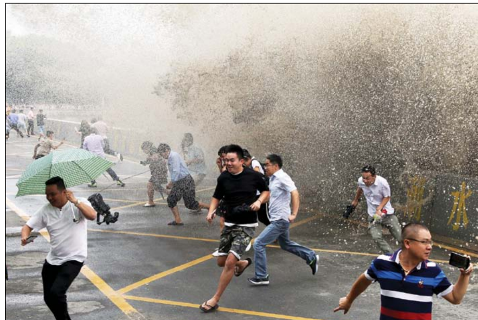
High tide: A wave hits spectators on Sept 8 at the Qiantangjiang estuary in Hangzhou, East China's Zhejiang province. Thousands gathered to watch the annual tidal action.