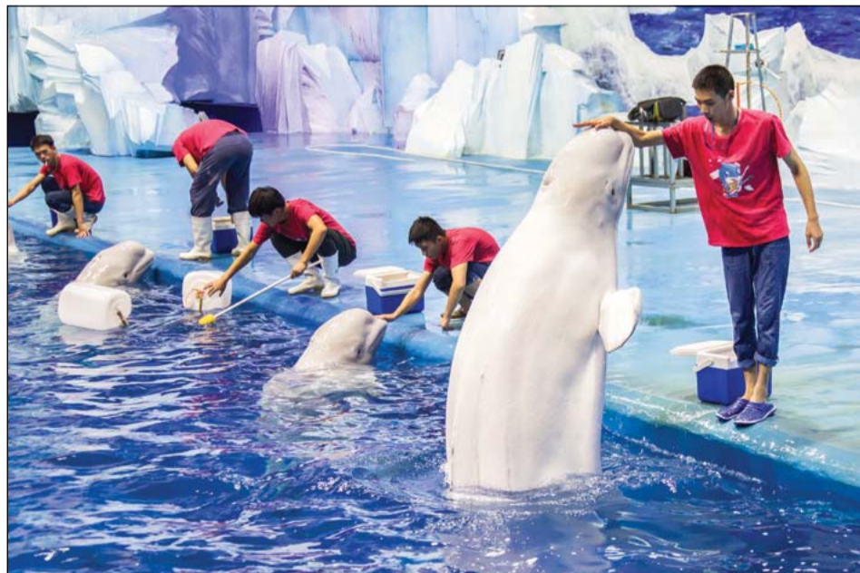
Water show: After a year of training, five white whales from Russia perform at Fuzhou Luoyuanwan Ocean World in the city of Fuzhou, East China's Fujian province.