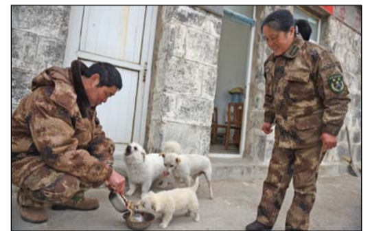
AFTER a patrol, the couple find their dogs are hungry.