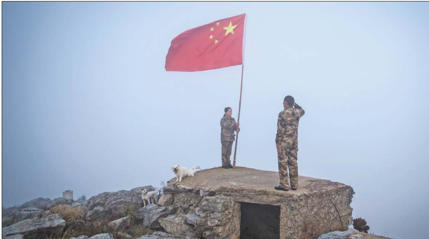
WANG JICAI salutes the national flag on the easternmost hill on Kaishan Island.