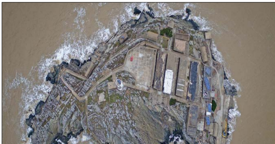
ABOVE: An aerial photo of Kaishan Island in the Yellow Sea.